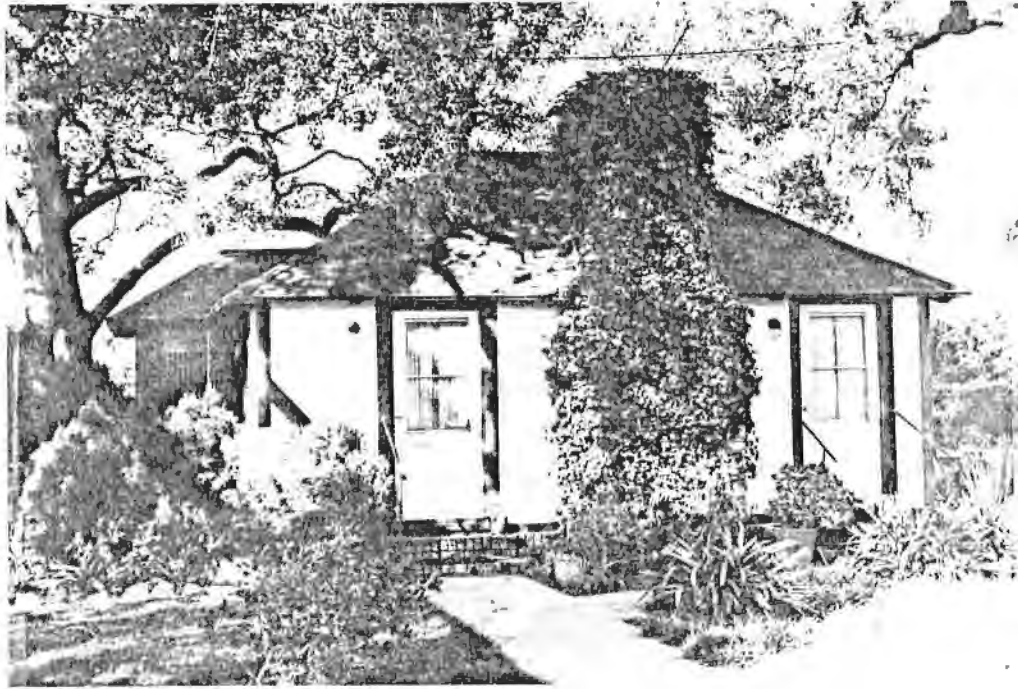
2464 Ojai Avenue