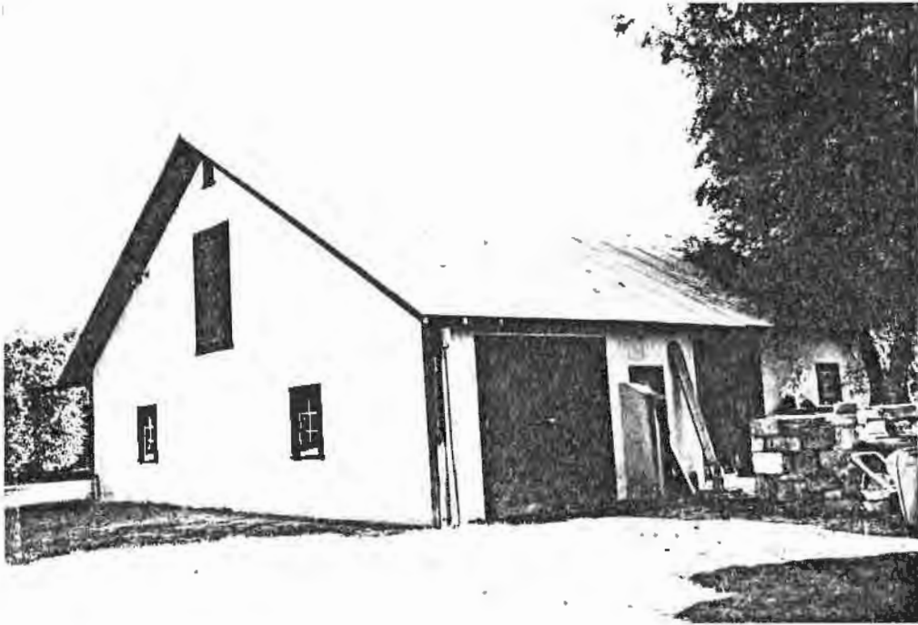
2508 Ojai Ave.

The barn is similar in style to the house with stucco siding, a high pitched gable roof and wide doors. Later it appears to have been converted to a residence with muti-paned windows and door. Both structures were built about the same time and were probably originally of clapboard siding.