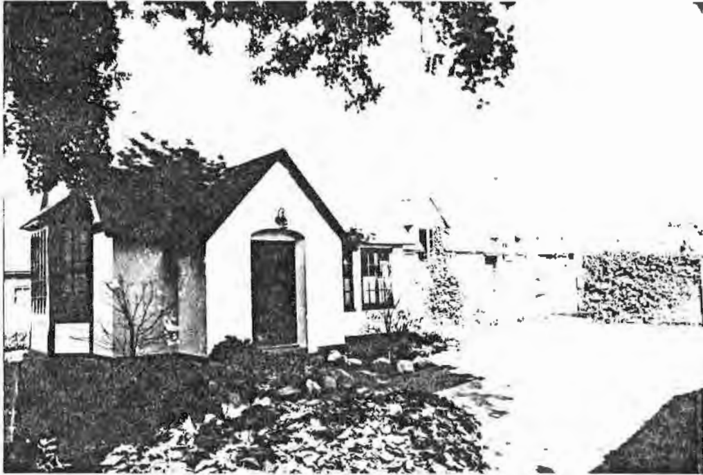
2464 Ojai Avenue

This attached row of cottages is similar in style to the main house with steep gable roofs and high pitched gable over entries with segmented arch over the door. Windows are multi-paned. These cottages were used for servants and guests of the Wiest family.