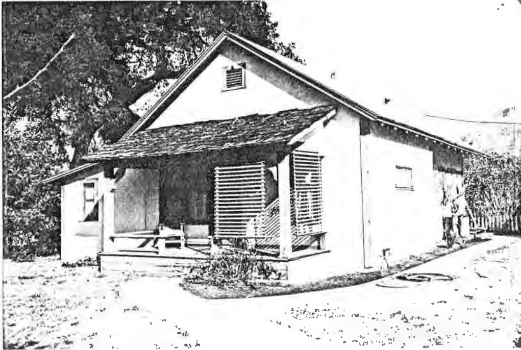
2508 Ojai Ave.

This small single story rectangular shaped building has a medium gable roof with exposed rafters under the eaves. A shed roof extends over the porch, and is supported by wood columns with curved brackets. There is a shed roof addition on the west side. This simple bungalow has been stuccoed, and the front door has multi-paned glass with double hung windows on each side. This house, built about 1916, was the foreman's residence on the Wiest property for many years. it was allegedly used as a school house.