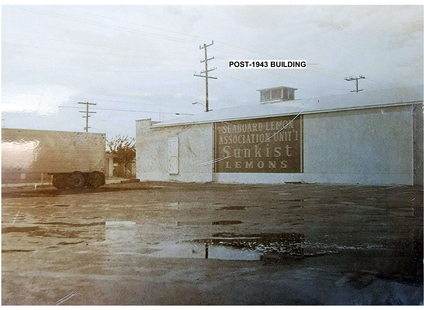
EAST ELEVATION OF WAREHOUSES ALONG COLONIA ROAD, 1970s