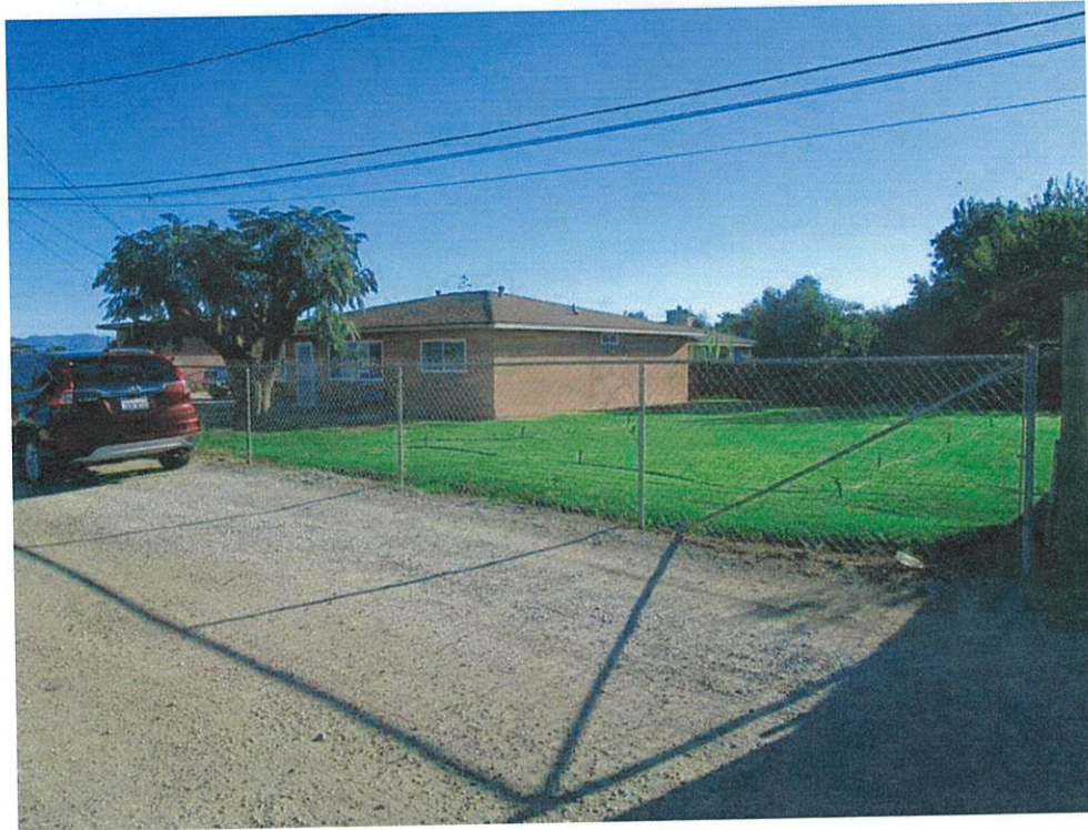
VIEW OF RESIDENCE AND YARD