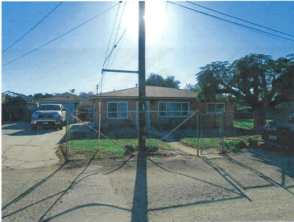
FRONT VIEW OF SINGLE FAMILY RESIDENCE