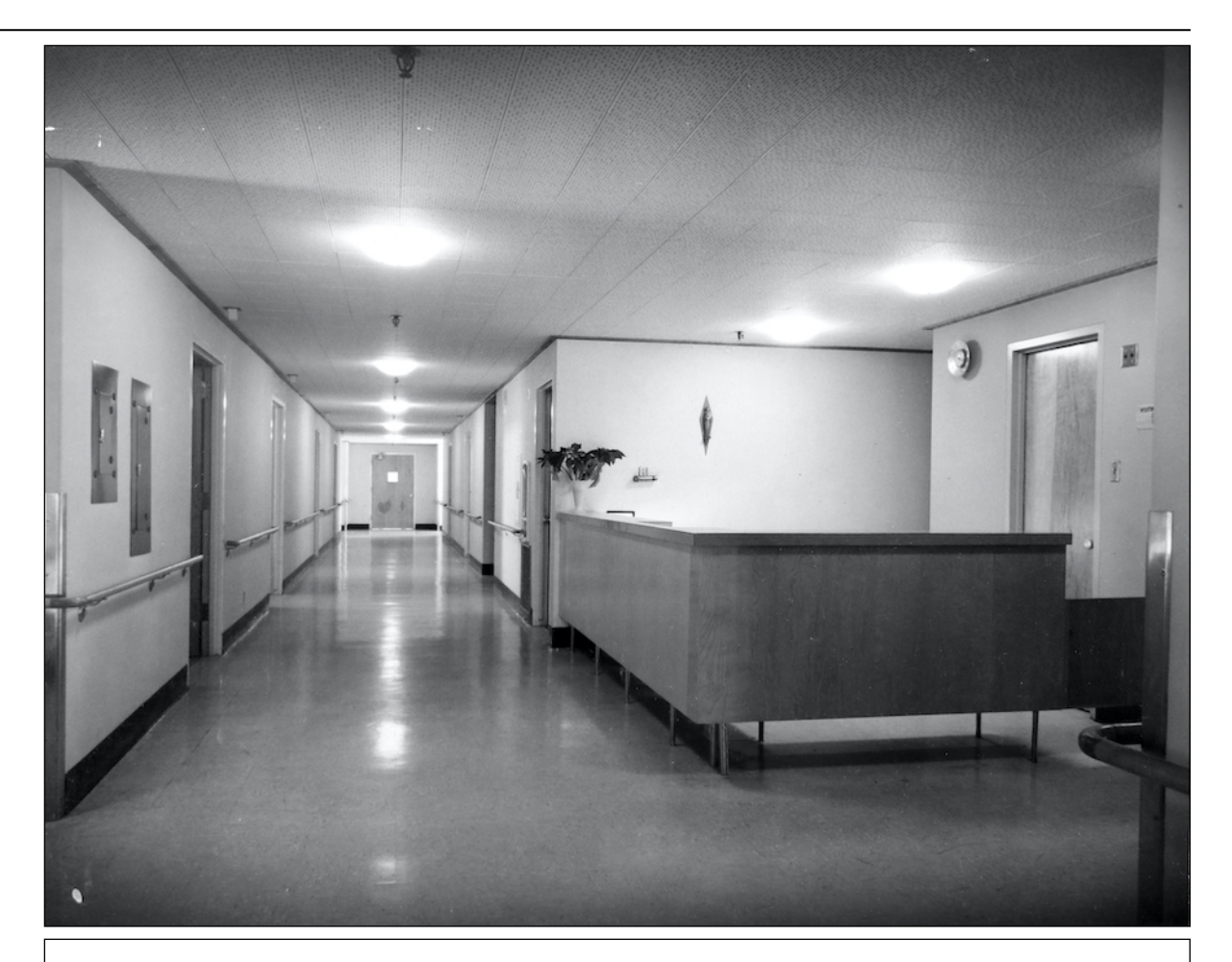
Figure 3. Interior hallway and nurse's station (undated historic photo, probably c. 1960).

for around thirty years, was responsible for a substantial number of designs for the Catholic Church in Southern California, including churches, schools, and hospital buildings.<sup>11</sup>