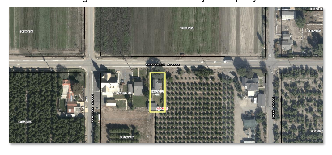
Figure 1 – Aerial View of Subject Property

The subject residence, generally rectangular in shape, has a high gable with a side-facing gable wing.<sup>5</sup> In the rear is another higher gable addition. The eaves are boxed, and the front porch is recessed under the main gable and enclosed with the lower portion of concrete block and the upper portion of screened windows. The entrance is on the side with concrete steps and iron railing. Windows were originally double hung with raised wood moldings, since replaced with vinyl-clad windows. The house rests on a concrete foundation and is covered with wide board siding.<sup>6</sup> Refer to Figures 1 and 2 below for aerial and street views of the subject property, respectively. Figure 3 demonstrates the location of the proposed additions.