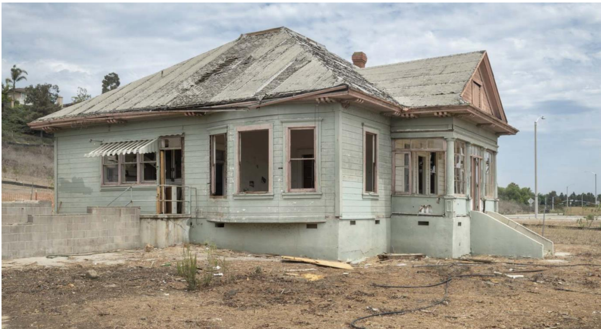
Figure 5 – Scholle Farmhouse, City of Camarillo