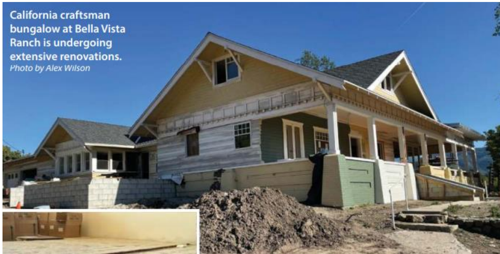
Figure 2 – Residence at Bella Vista Ranch During Rehabilitation