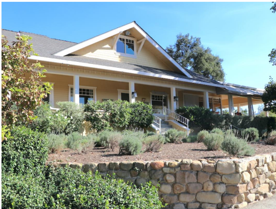
Figure 1 – Residence at Bella Vista Ranch Before Rehabilitation