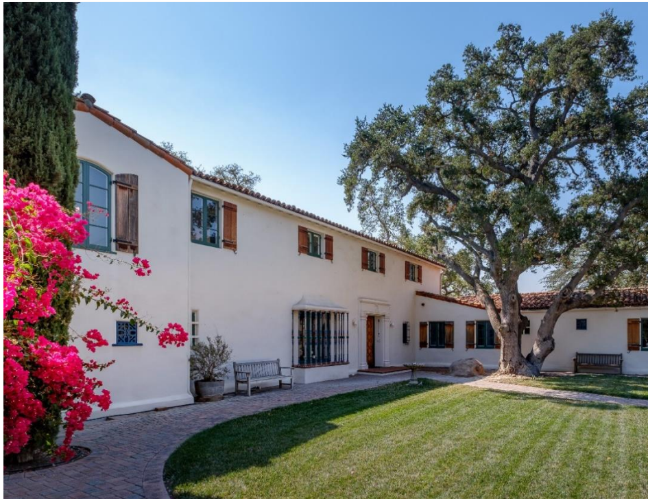
Figure 4 – Residence at Noble Oaks Estate, Ojai