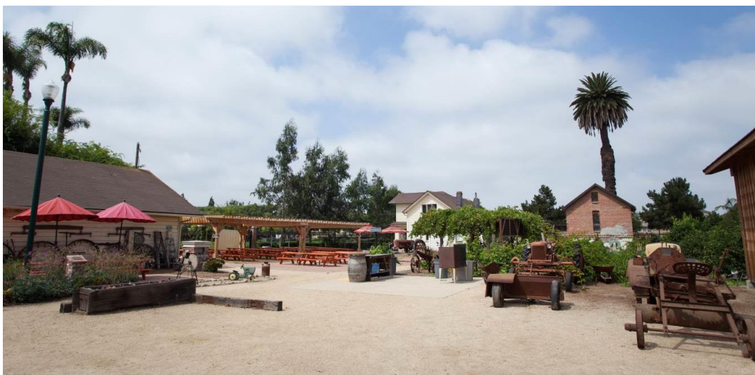
Figure 3 – Oxnard Historic Farm Park, City of Oxnard