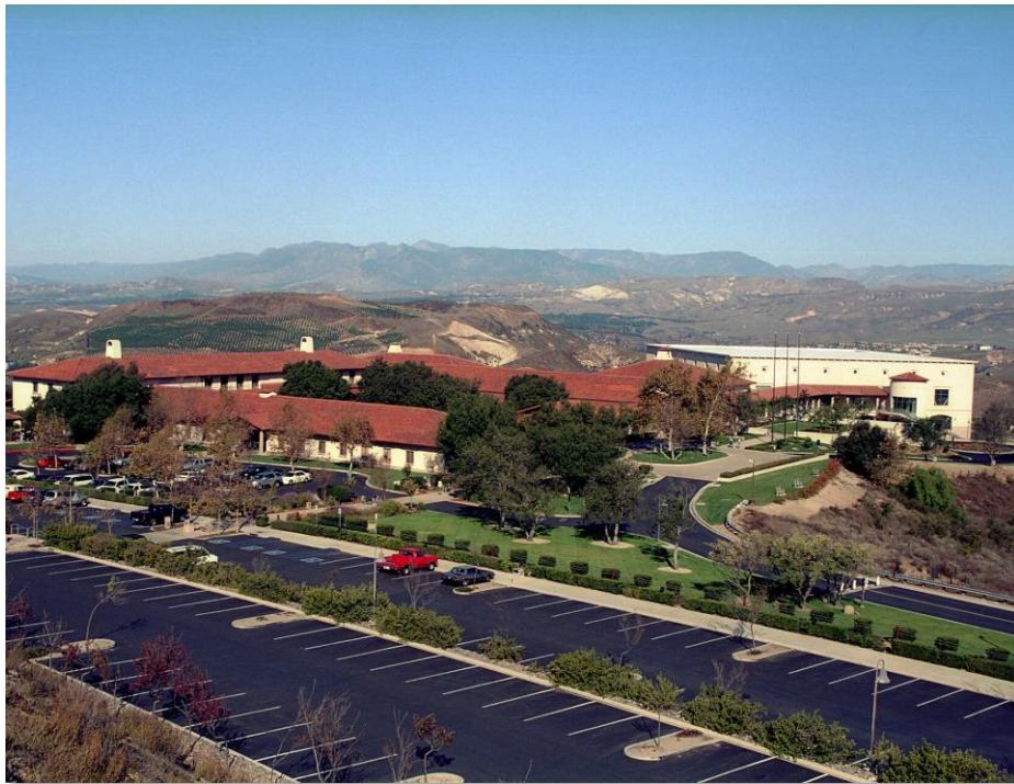
Figure 7 – Ronald Reagan Presidential Library