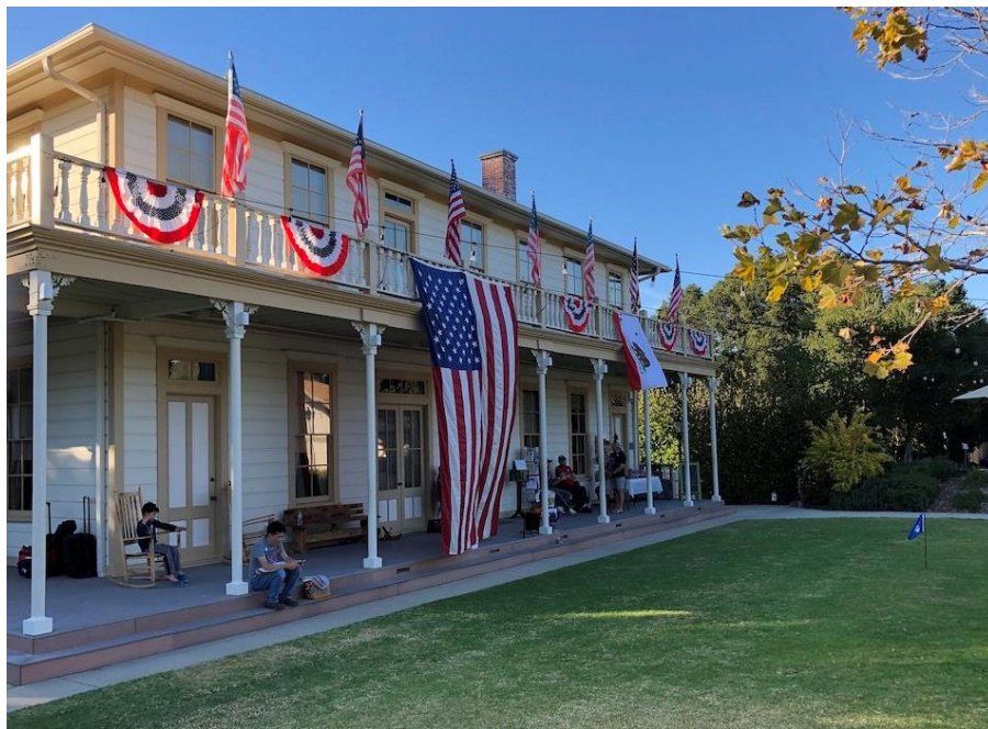
Figure 8 – Stagecoach Inn