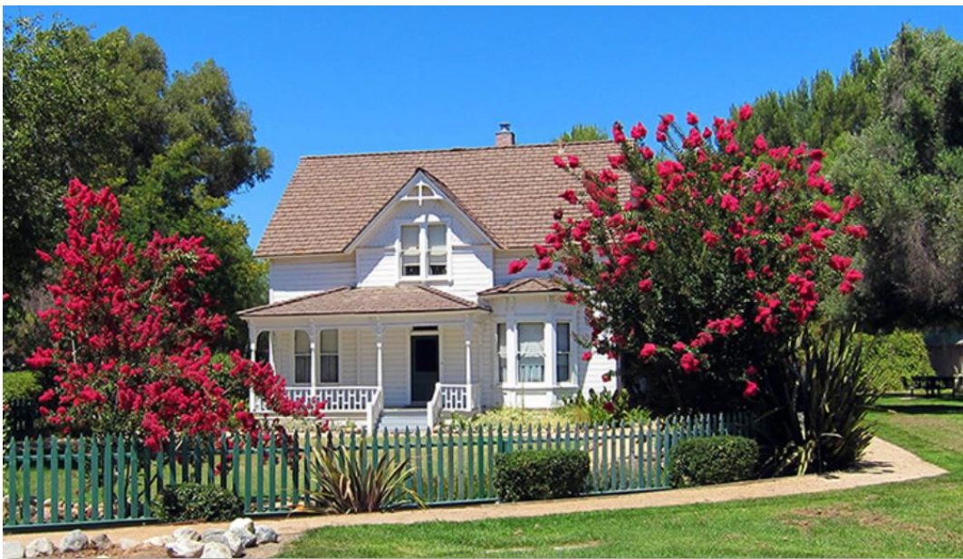
Figure 9 – Strathearn Historical Park