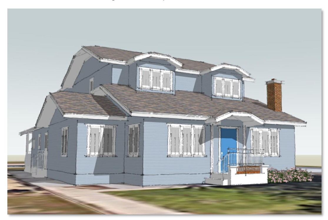
Figure 2 – Proposed Profile