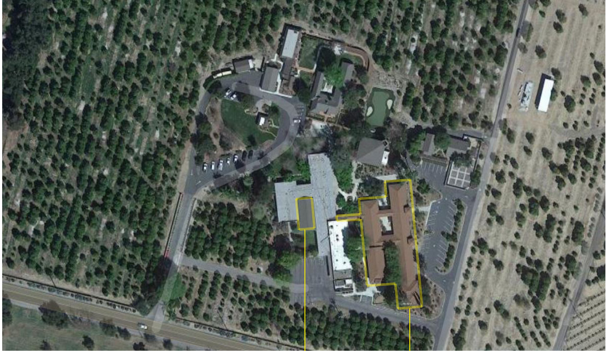
CARE CENTER COVERED PATIO