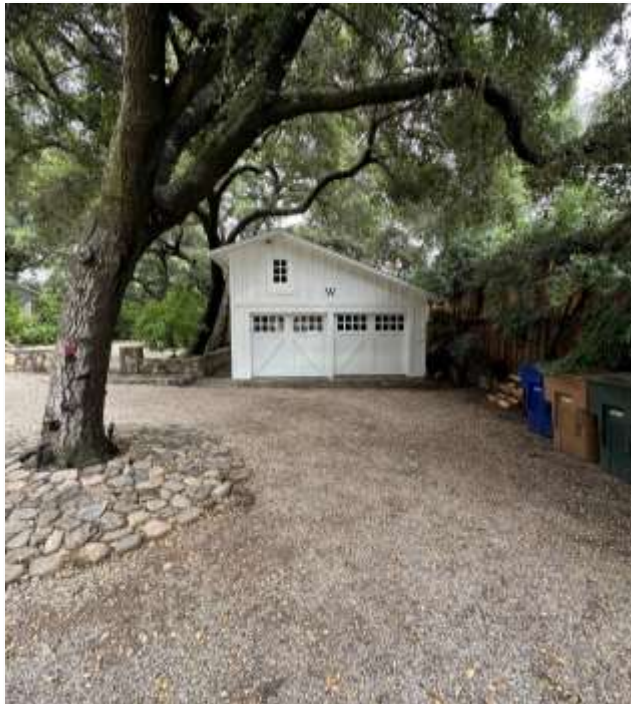
Figure 8 – View of Detached Garage from Driveway