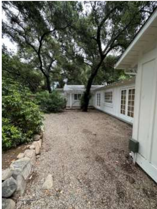
Figure 6 – View of Residence’s South Elevation