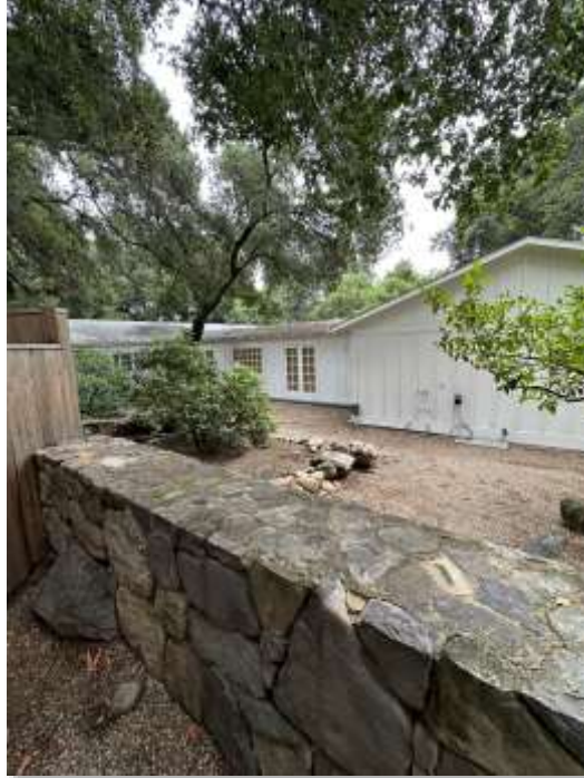
Figure 5 – View of Residence’s South Elevation