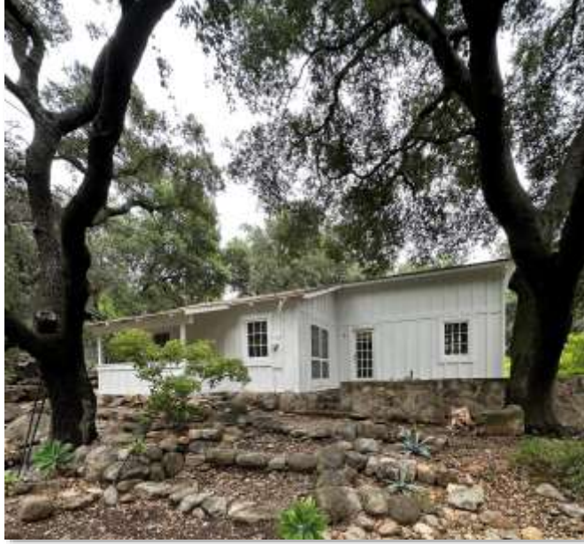
Figure 3 – View of Residence’s West Elevation