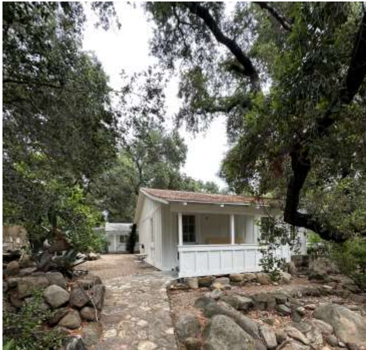
Figure 4 – View of Residence’s West Elevation