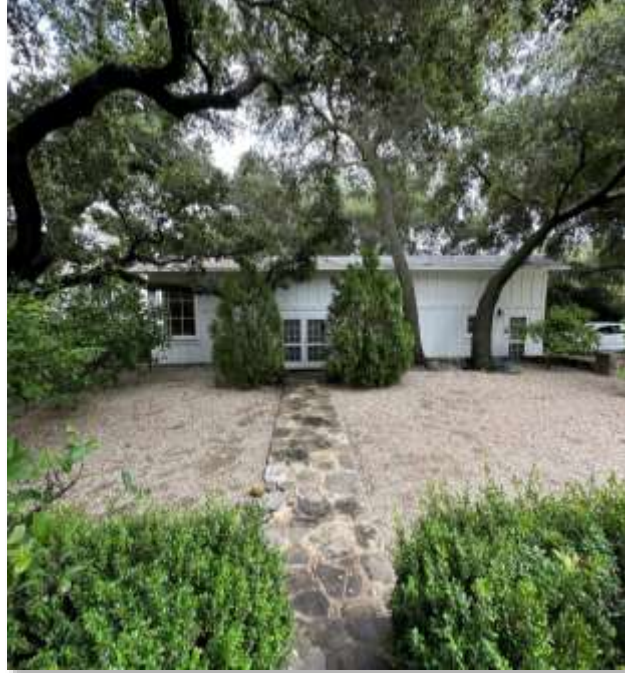
Figure 7 – View of Detached Garage from Residence