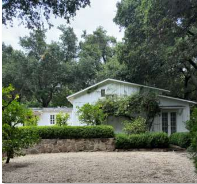
Figure 1 – View of Residence’s South Elevation (East Wing)

800 S. Victoria Avenue, Ventura, CA 93009-1740 • (805) 654-2478 • www.vcrma.org/divisions/planning