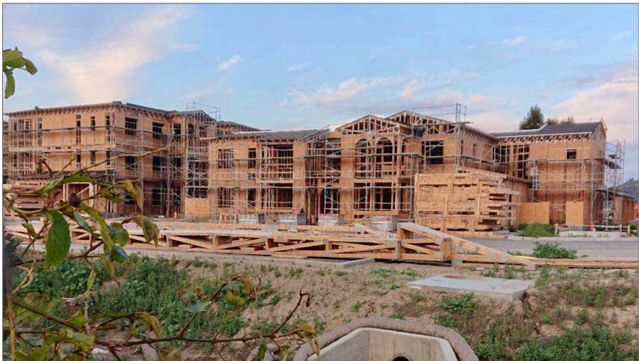
Construction photo of Phase I of the Somis Ranch Farmworker Housing Complex, March 2023.

For the 200 units permitted for Phase I of the Somis Ranch Farmworker Housing Complex, staff contacted the project developer, AMCAL Multi-Housing, Inc. to determine a rental estimate of the units. As a condition of the project's approval, the deed for the housing complex has been restricted based on their affordability agreement requirements, to be rented out to low- and very-low-income households (See discussion in the Anticipated Development section below). AMCAL Multi-Housing, Inc. currently estimates 140 low-income units, 40 very-low-income units, and 20 extremely-low-income units in Phase I. However, this assumption only reflects current conditions, and the actual mix of affordability distribution of the units will be determined after construction of this 100 percent affordable housing project. Table 4 includes the estimated affordability breakdown for the 200 units of the Somis Ranch Farmworker Housing Complex.