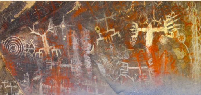
Burro Flats Painted Cave | Simi Hills

To learn more about indigenous history in Ventura County, please visit vlandmarks.org .