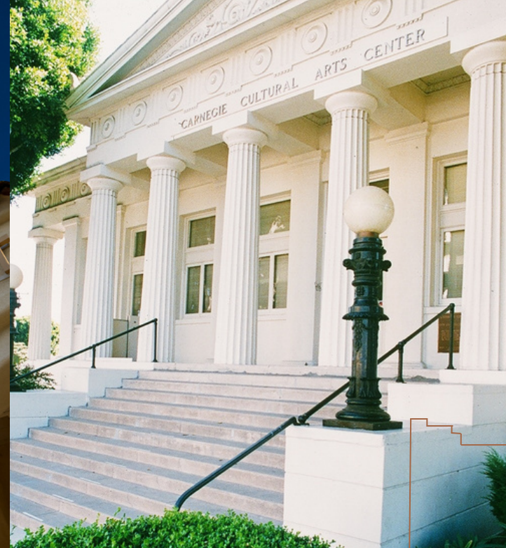
Oxnard Carnegie Library | Oxnard | Designated 1971