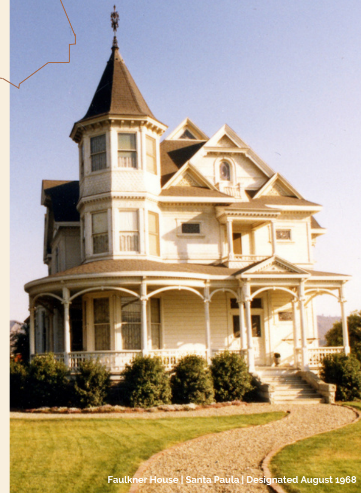
Faulkner House | Santa Paula | Designated August 1968